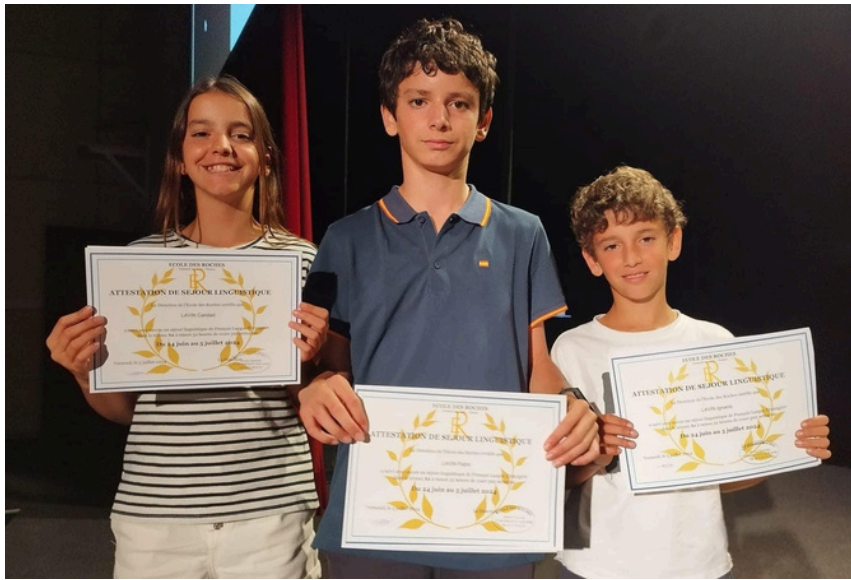
At the end of the course, the students receive a pedagogical report and a certificate of training.